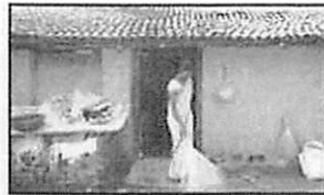
Innovations around the World That Are Making a Dent in Global Poverty Promoted by: Middle-class Success