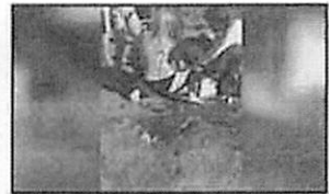
VIDEO: River brawl caught on camera