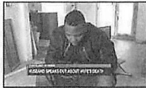
Husband of late firefighter is speaking out